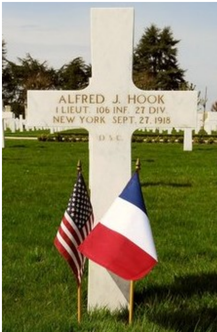
Somme American Cemetery and Memorial