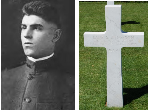
Somme American Cemetery and Memorial