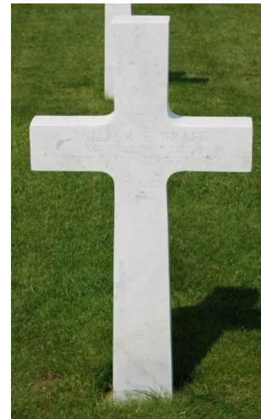
Somme American Cemetery and Memorial