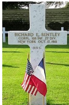
Somme American Cemetery and Memorial