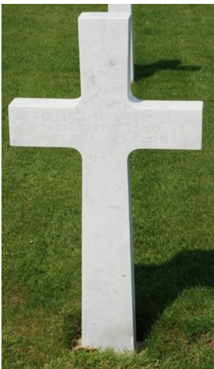
Somme American Cemetery and Memorial