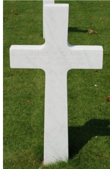
Somme American Cemetery and Memorial