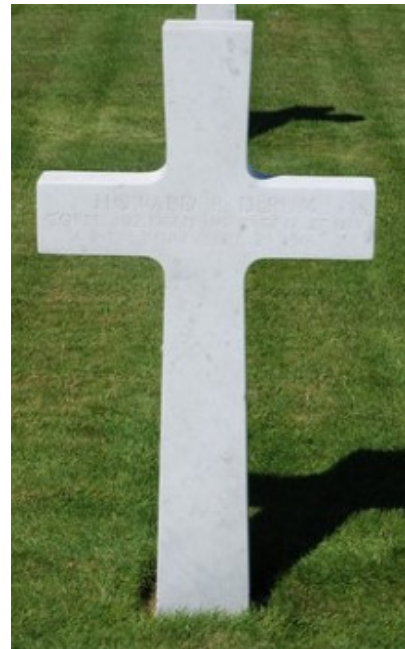
Somme American Cemetery and Memorial